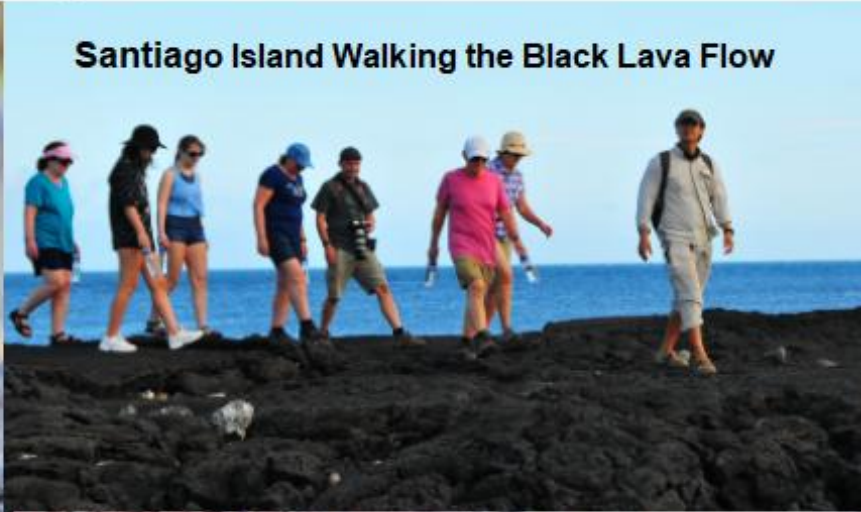
Santiago Island Walking the Black Lava Flow