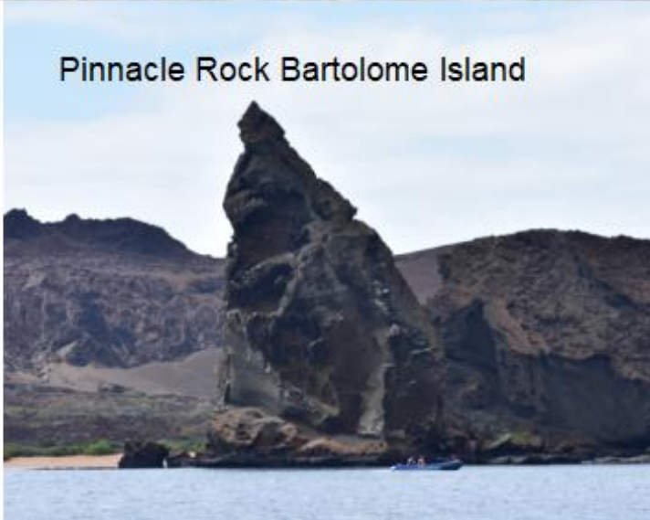
Pinnacle Rock Bartolome Island