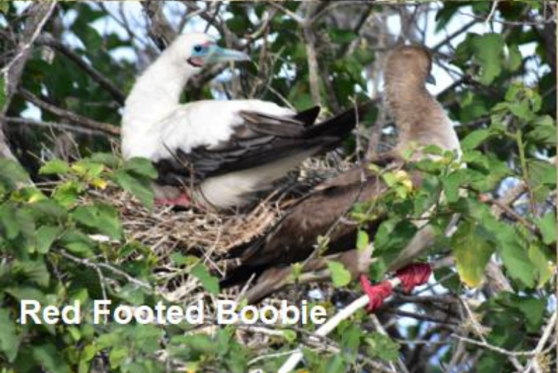
Red Footed Boobie