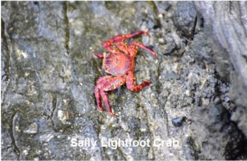
Sally Lightfoot Crab