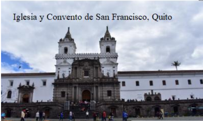
Iglesia y Convento de San Francisco, Quito