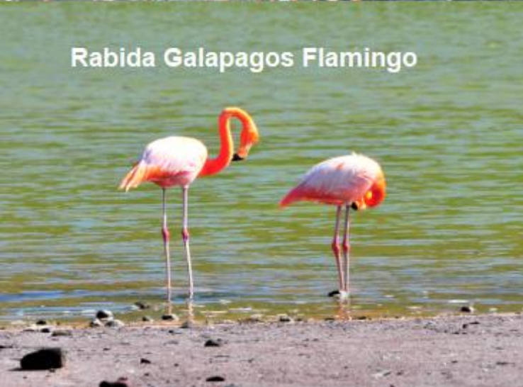
Rabida Galapagos Flamingo