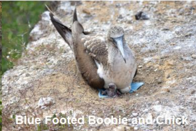
Blue Footed Boobie and Chick