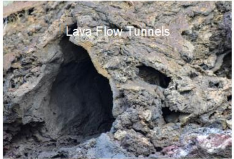
Lava Flow Tunnels