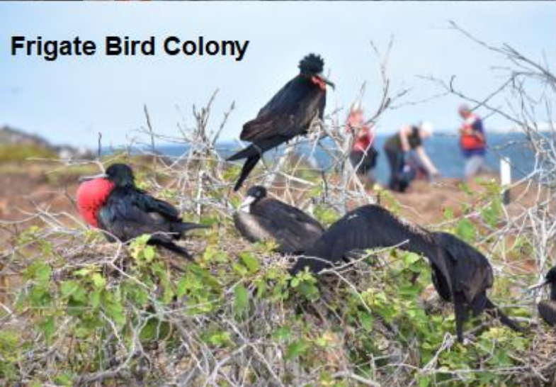
Frigate Bird Colony