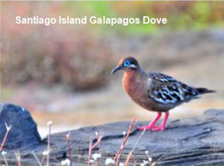
Santiago Island Galapagos Dove