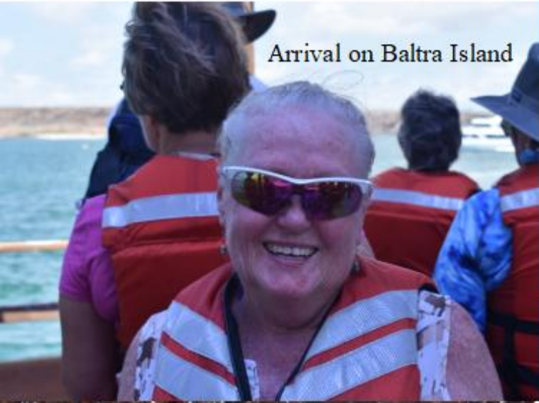
Arrival on Baltra Island