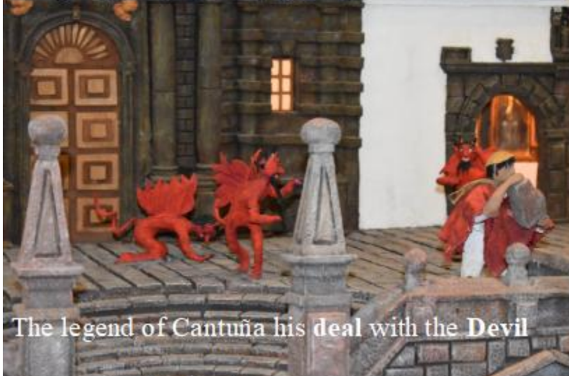
The legend of Cantuña his deal with the Devil